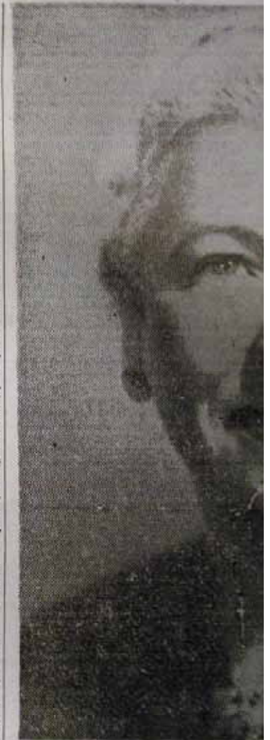
PEARL BUCK . . .